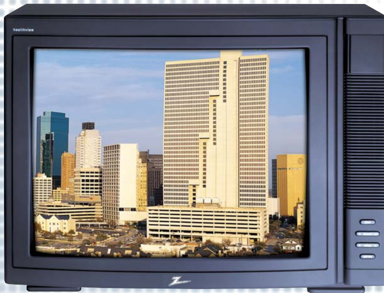
20" Remote Control Color TV H20H52DT